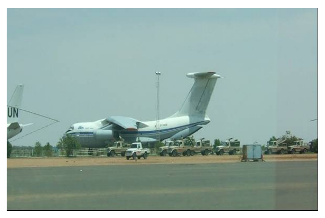
Figure 3 Ilyushin 76 aircraft at El-Fasher airport on 31 July 2006

84. On 31 July 2006, at approximately 1400 hours, the Panel witnessed approximately seven Toyota pickup trucks mounted with light machine guns and a large number of troops of the Sudanese armed forces being unloaded from an Ilyushin 76 at the El-Fasher airport (see fig. 3). Reliable sources stated that this was only one of approximately 10 such flights that had landed during the past week. Such daylight transfers of military personnel and equipment using commercial air cargo companies are blatant violations of the arms embargo and are indicative of a significant attitude shift on the part of the Government of the Sudan regarding its adherence to the sanctions imposed by the United Nations.