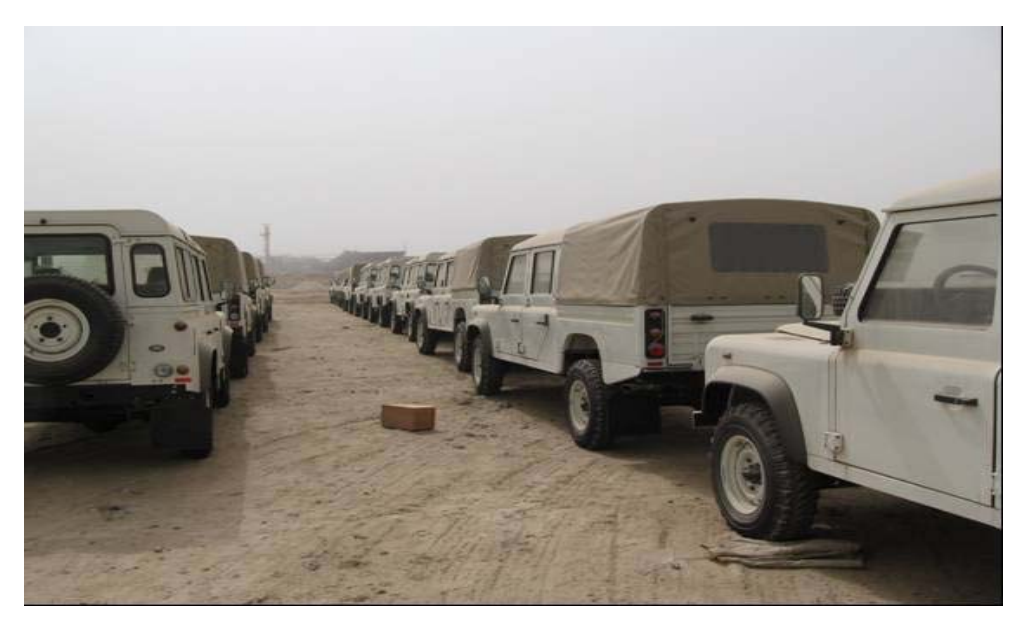
Figure 6 Unmarked white vehicles at Port Sudan on 26 July 2006

101. The Panel visited the port and witnessed a large consignment of imported Land Rovers, painted off-white (see fig. 6). Similar vehicles were been seen by the Panel in Darfur, being used by NGOs and aid agencies. There are also unconfirmed reports of the use of such white-painted vehicles in Darfur by the Government of the Sudan and other Janjaweed/militias supported by it to camouflage them as NGO vehicles.