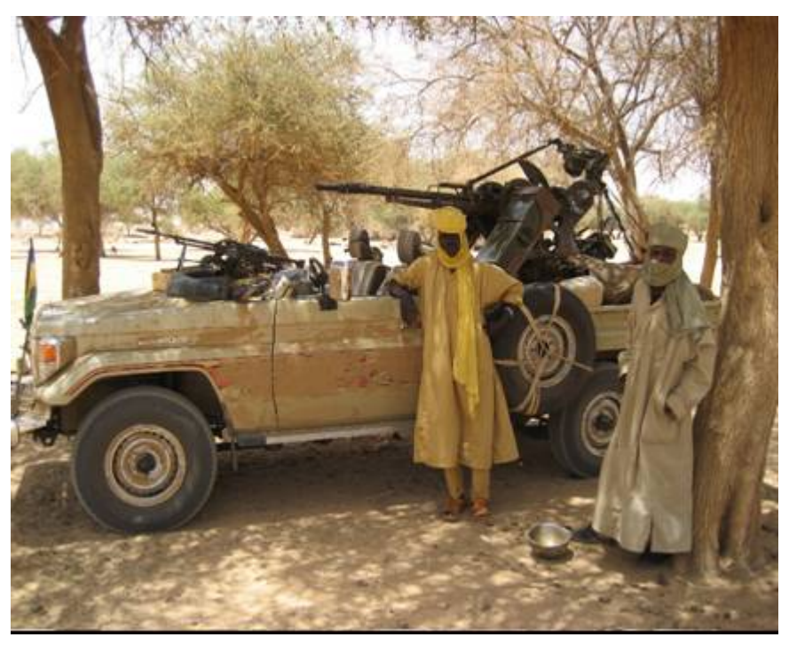
Figure 1 Armed rebels at Umm Sidr on 30 June 2006

al-Nur. The split showed a deep and dangerous divergence of agenda, mainly between the Fur and Zaghawa components.