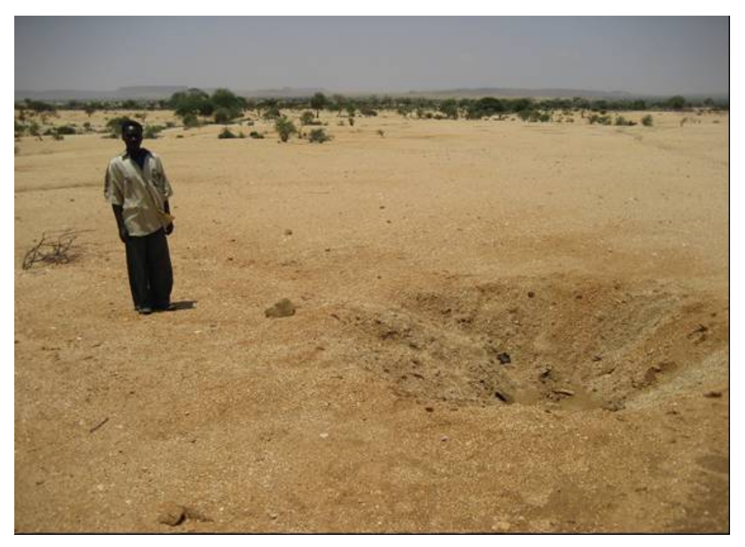
Figure 12 One-metre-deep bomb crater near the villages bombed on 31 July 2006

214. On 31 July 2006, a cluster of villages composed of Gimmeza, Bobai and Krekir, north of Kafod, were bombed by an Antonov aircraft (see figs. 11 and 12). The first bombing run started at 0900 hours with a nine-bomb stick to the west of the villages and 13 bombs to the east. At 1300 hours, the Antonov returned and again bombed the same area with a five-bomb stick to the east of the villages, a seven-bomb stick in the village gardens and eight bombs to the north. Two village huts were destroyed and some livestock were killed or injured. There were no human casualties. The same villagers also heard bombing in the area of Kulkul and Hashaba on 1 August.