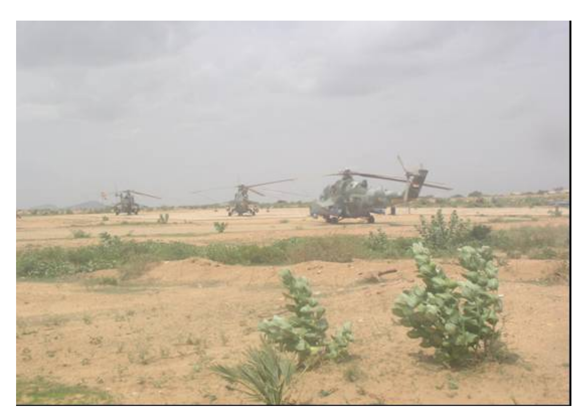
Figure 4 Mi-24 Hind attack helicopters at Geneina airport on 3 August 2006