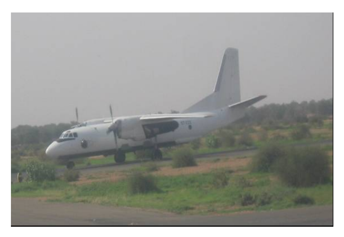
Figure 10 Second unmarked white Antonov aircraft landing at El-Fasher airport on 7 August 2006

207. Contrary to the claim of the Government of the Sudan, on 7 August, the Panel saw one white Antonov aircraft stationed at the El-Fasher airport bearing two numbers: one on its tail (7705) and another on its body (26563) (see fig. 9). The aircraft did not bear any emblem or logo. Since the aircraft was guarded by the Sudanese Armed Forces, it is believed to be a Government of the Sudan aircraft.