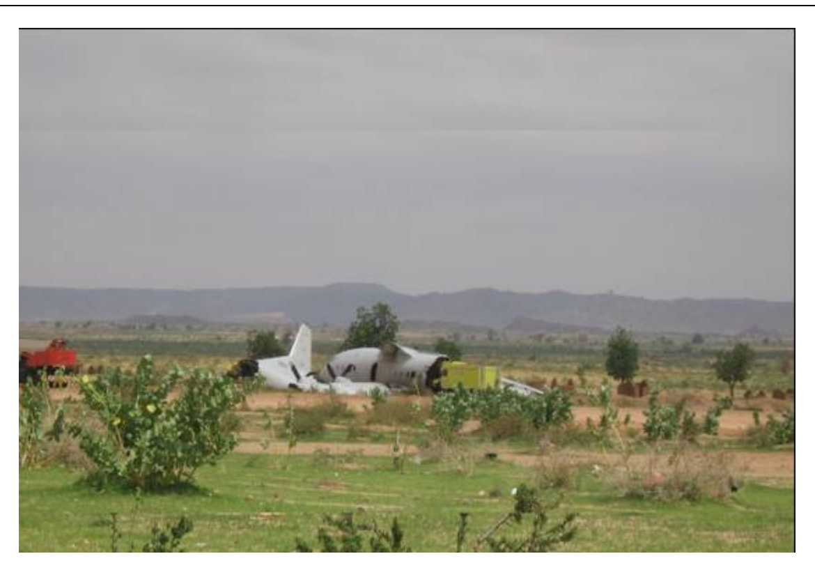
Figure 2 Antonov 12 aircraft at Geneina airport on 14 July 2006

83. On 14 July 2006, an Antonov 12 aircraft of the Government of the Sudan crashed on landing at Geneina airport (see fig. 2). The airport fire brigade attended to the aircraft and crew. Subsequently, approximately 30 tons of ammunition were removed from the aircraft and moved into Geneina. Reliable sources informed the Panel that this was one of several similar military shipments by the Government of the Sudan during the past few weeks.