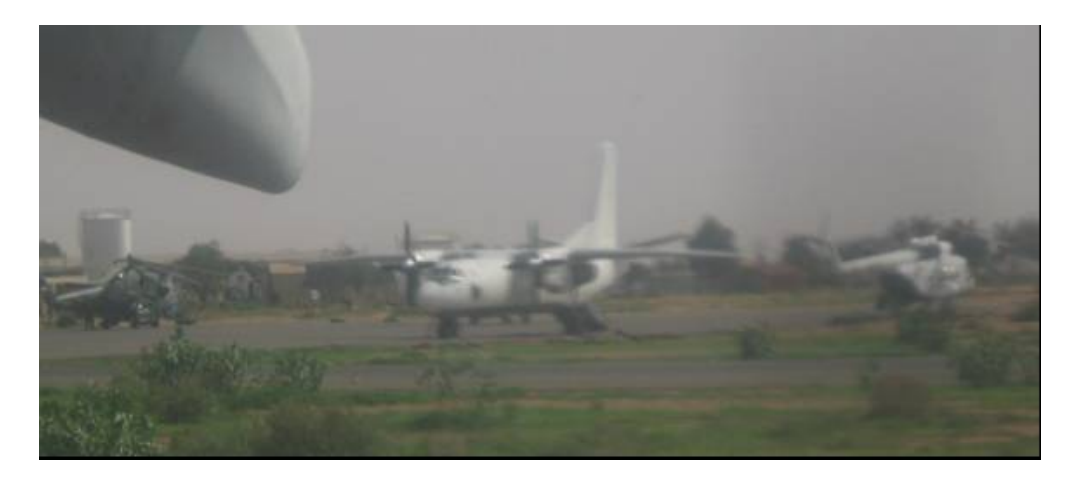
Figure 9 Unmarked white Antonov aircraft at El-Fasher airport on 7 August 2006

206. In its comments on the Panel's previous report, the Government of the Sudan stated that it does not have any white fixed-wing aircraft and that all its aircraft bear logos or emblems. In the same document, however, the Government did admit to using white helicopters for the transport of officials and tribal leaders attending reconciliation meetings, but not for any military purposes.