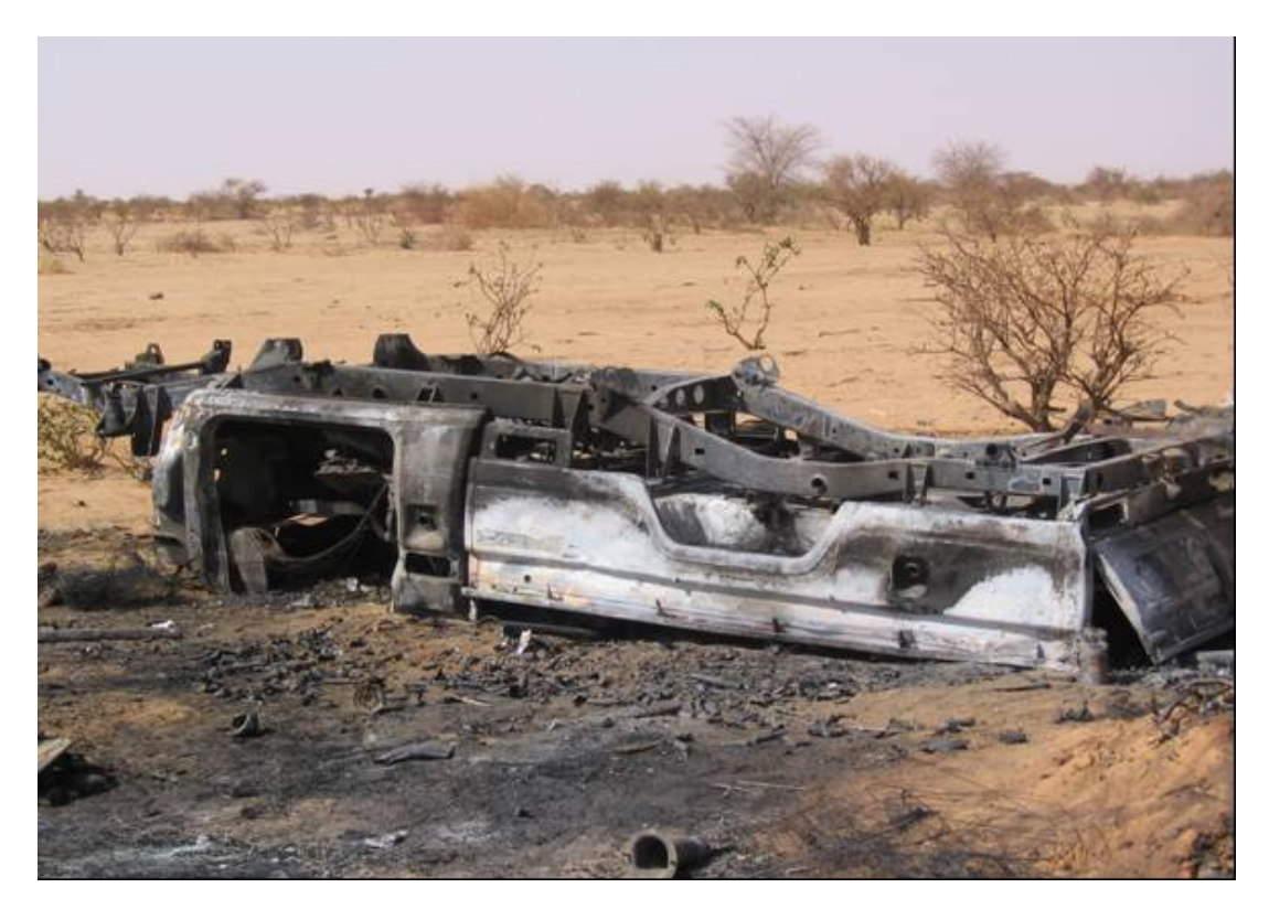
Figure 8 Burned car at Kulkul, 1 July 2006

been taken by AMIS helicopter to El-Fasher for treatment. They did not confirm any civilian casualties but mentioned their attack on a car used by the attackers, which was burned, possibly resulting in a few deaths.