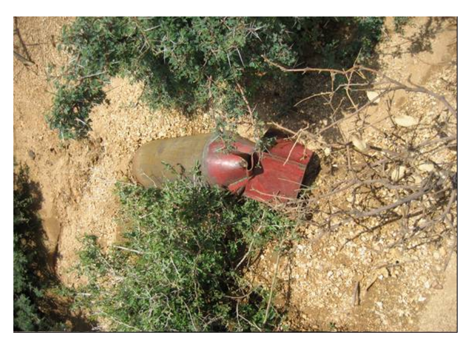
Figure 11 Unexploded bomb near the villages bombed on 31 July 2006